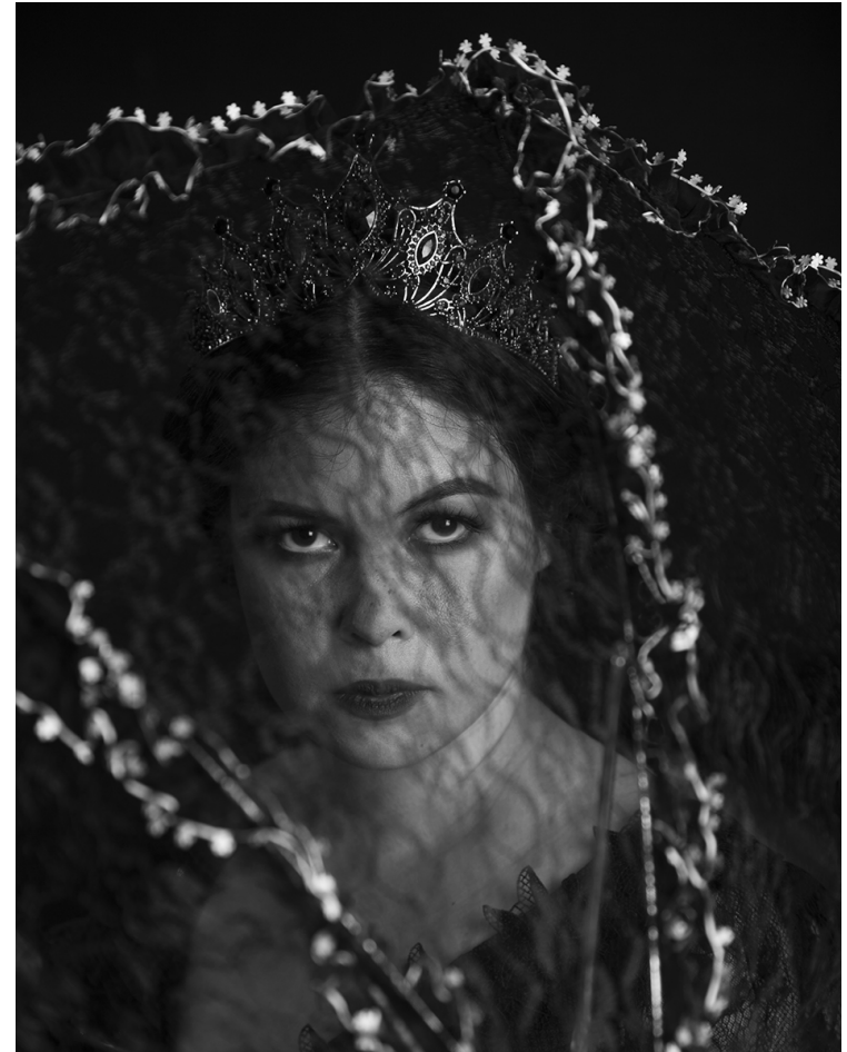
Through the Veil