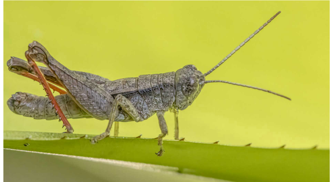
Spike Submitted David Crass