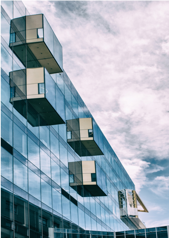
The NuSpace office pods_Newcastle U