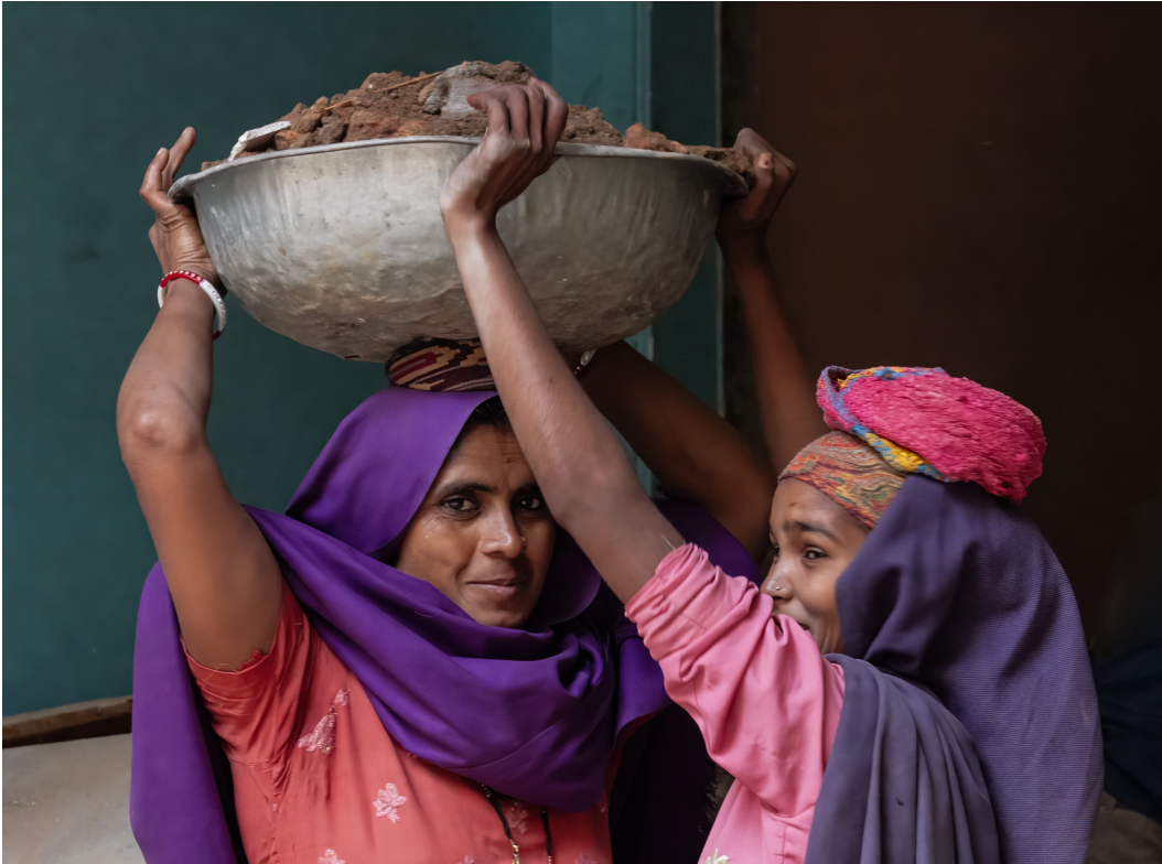
Passing the Load