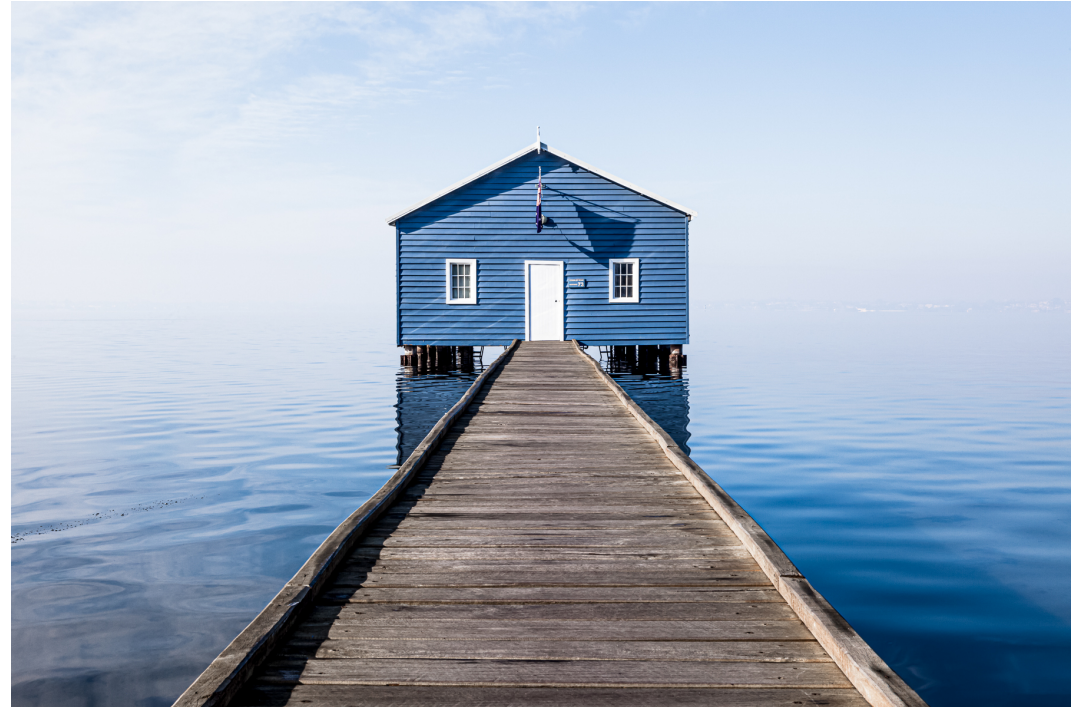
Blue Boat House