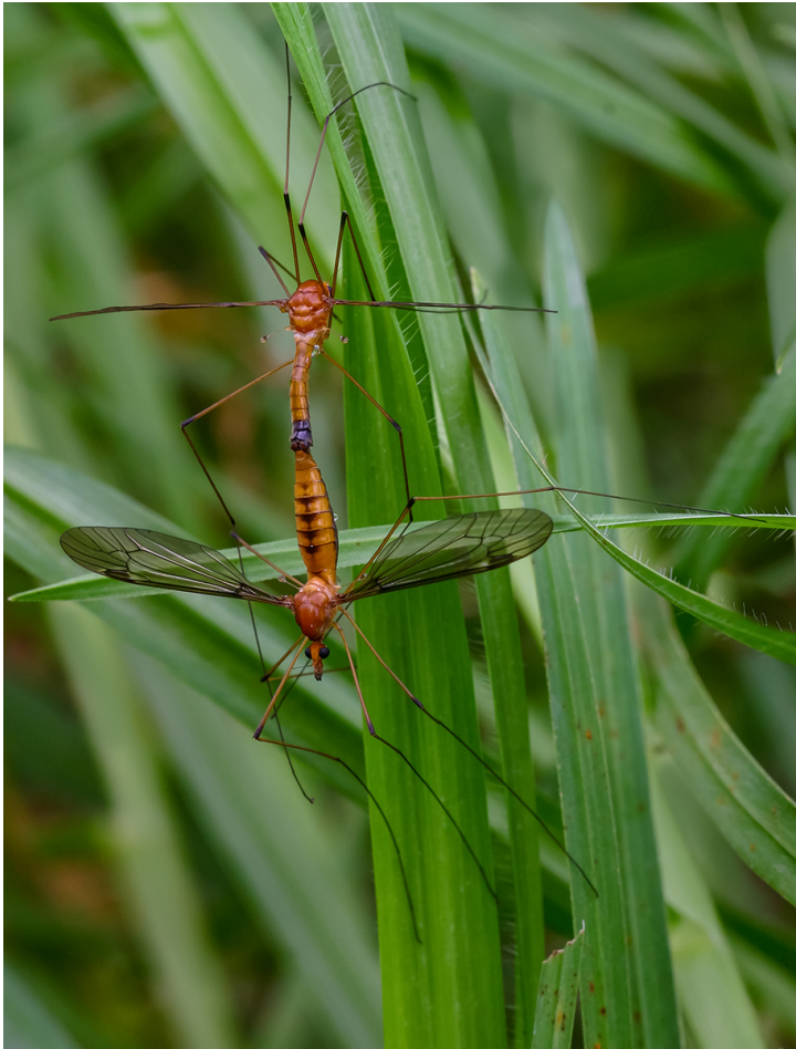
SCORPIAN FLY PAIRING