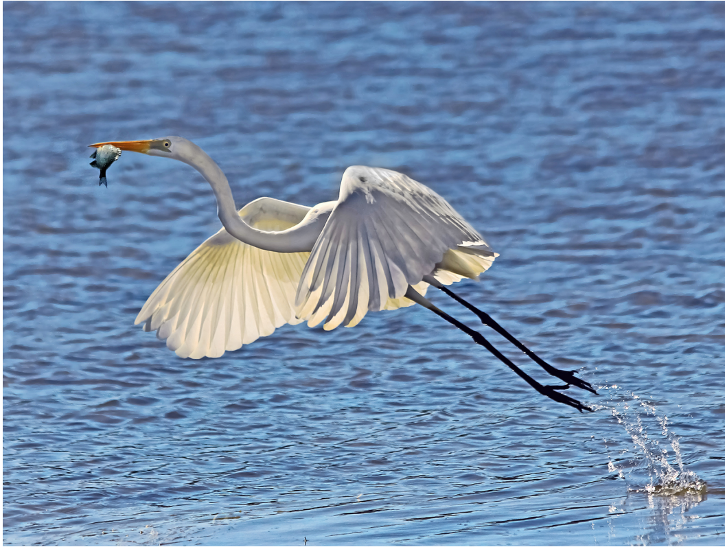
EGRET WITH FISH