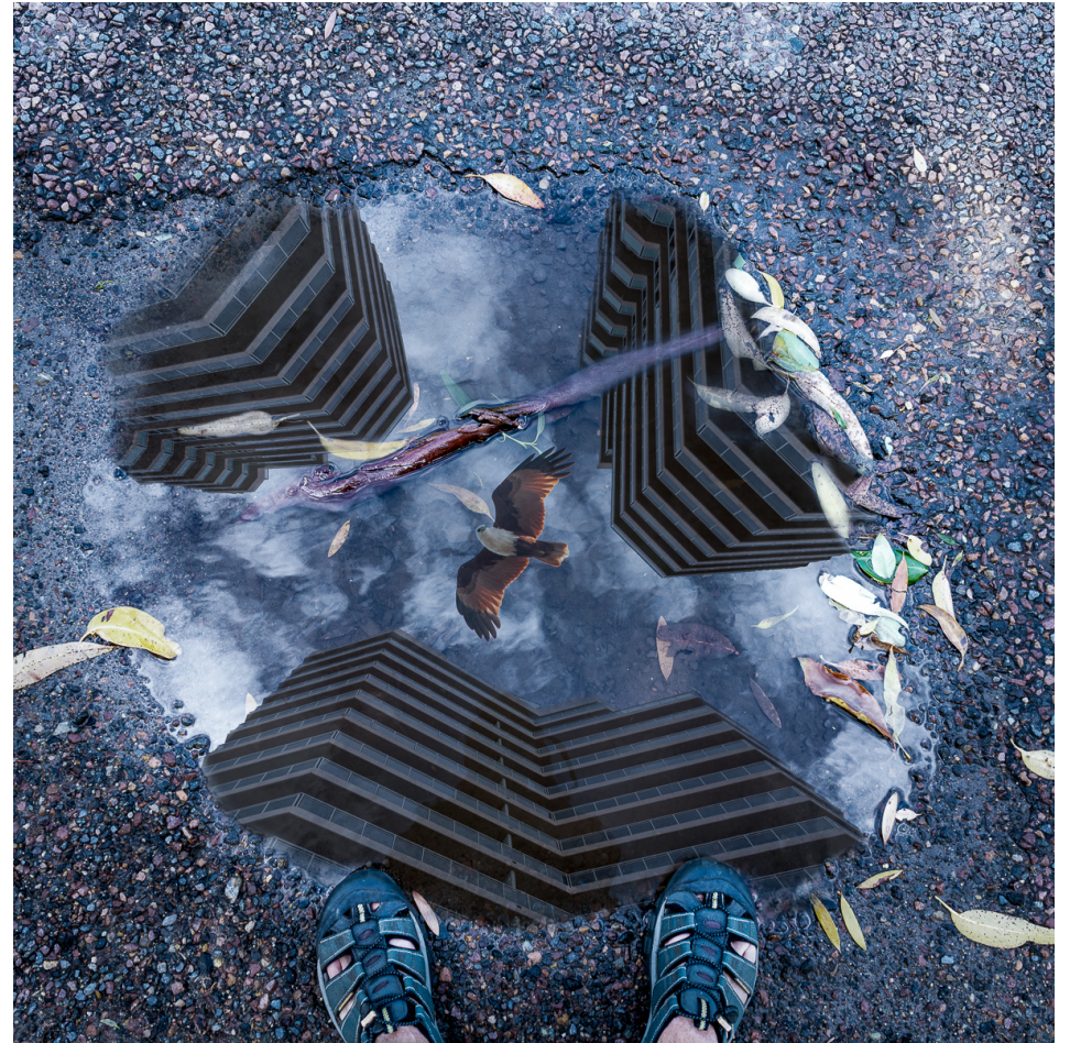
Reflection in a puddle