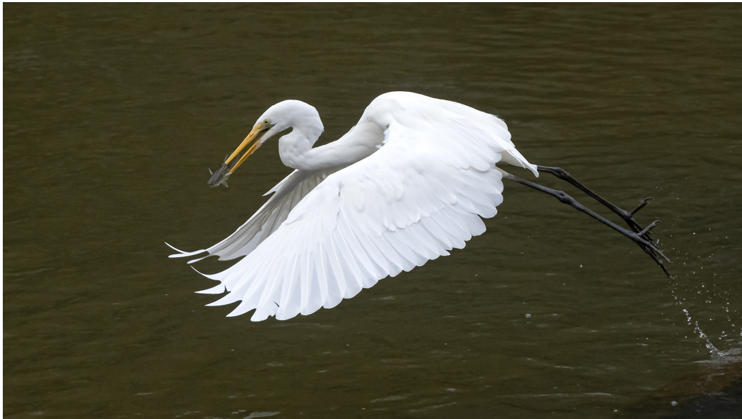
Lunch is Speared