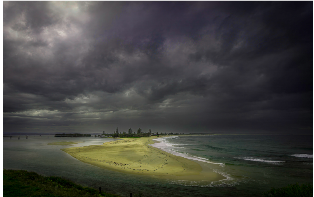
EntranceStorm Submitted James Humphries