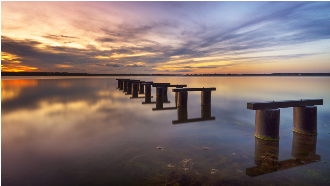
The Piers and the skies