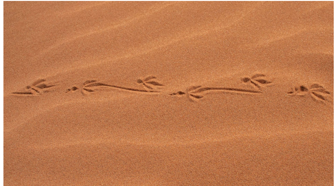
Tracks in the Sand