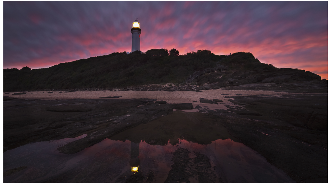
Sunset at dusk