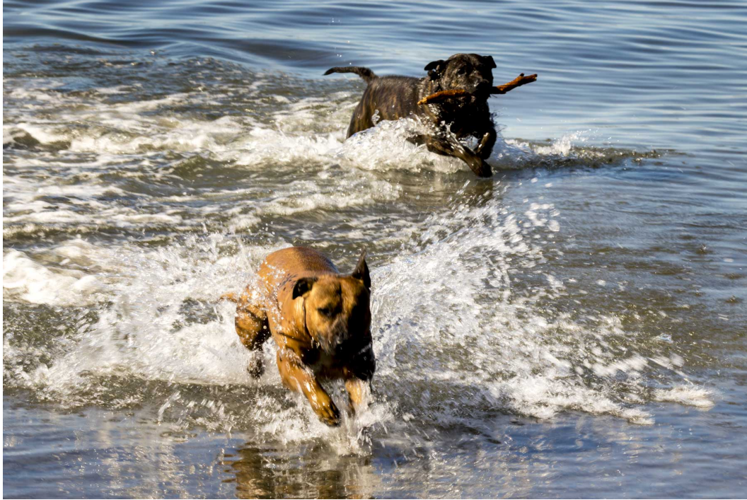
Morning Frolic Submitted David Crass