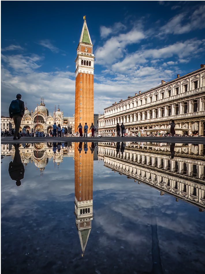
Venice at high tide