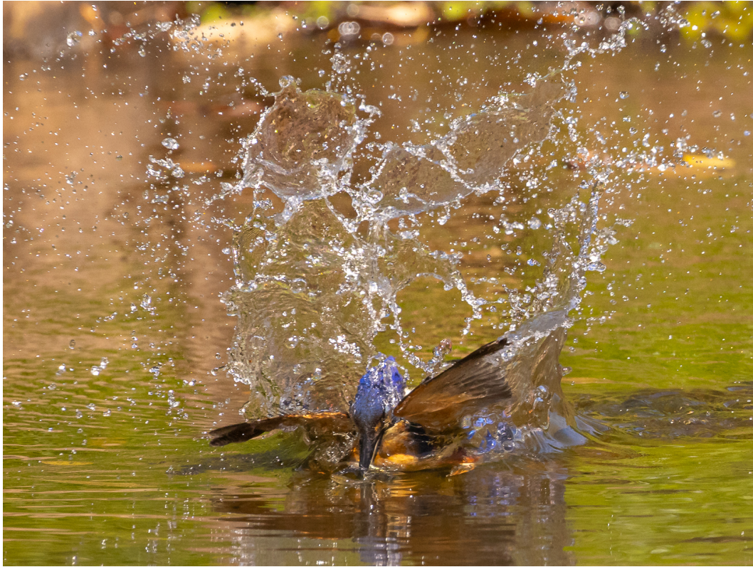
Azure Dive and Catch