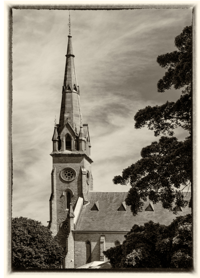
The Church on The Park_Newcastle