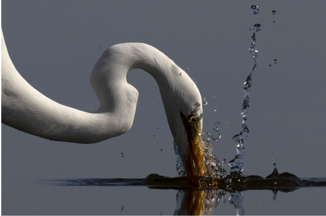
Equal and Opposite.