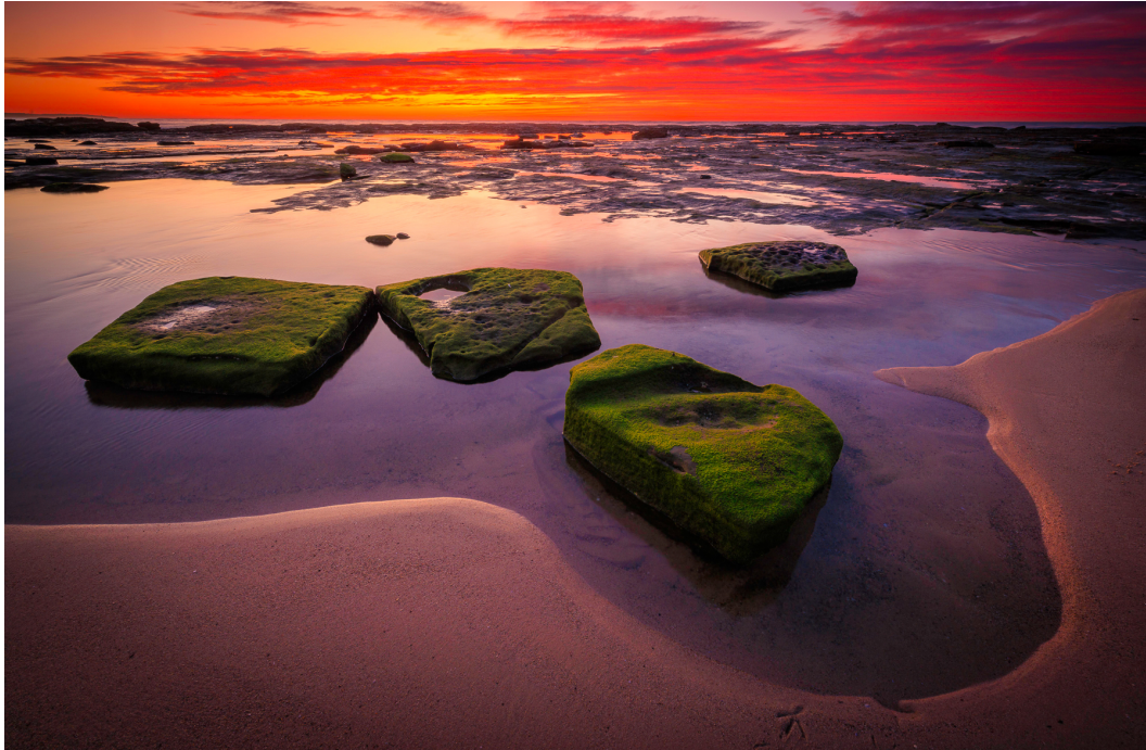
Entrance Early Submitted James Humphries