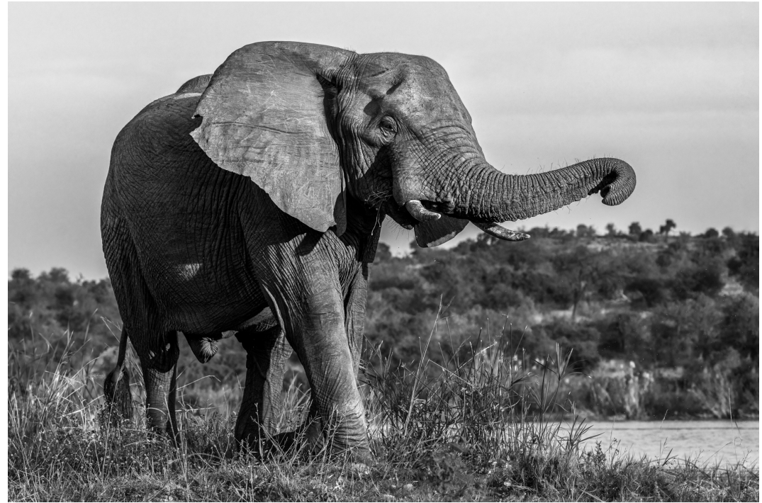
Bull Elephant Walk By