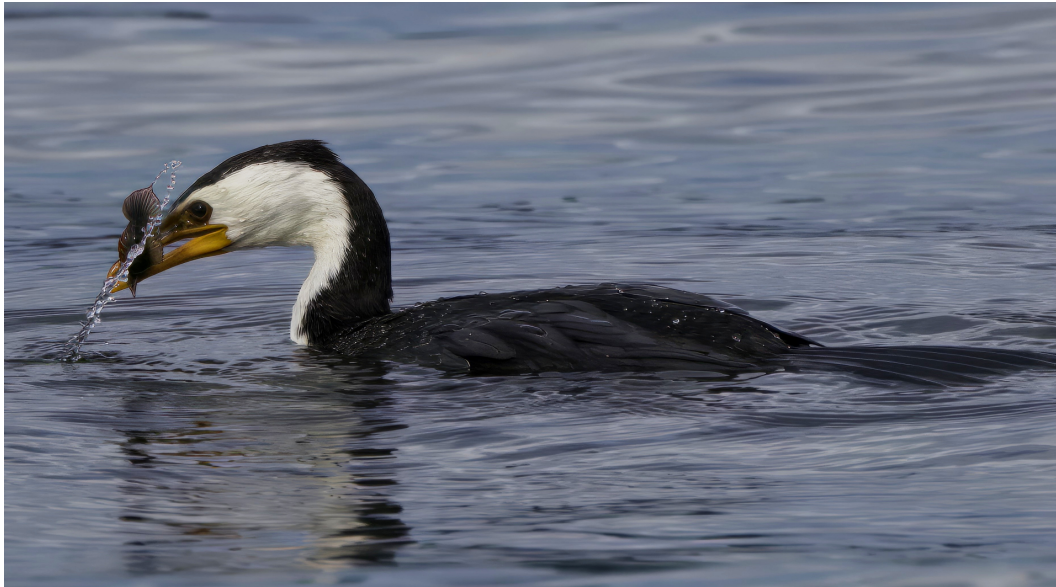
Circle of Death