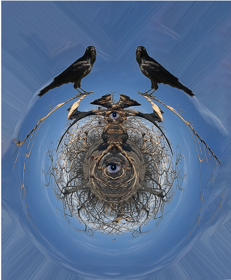
Eyes of the aftermath