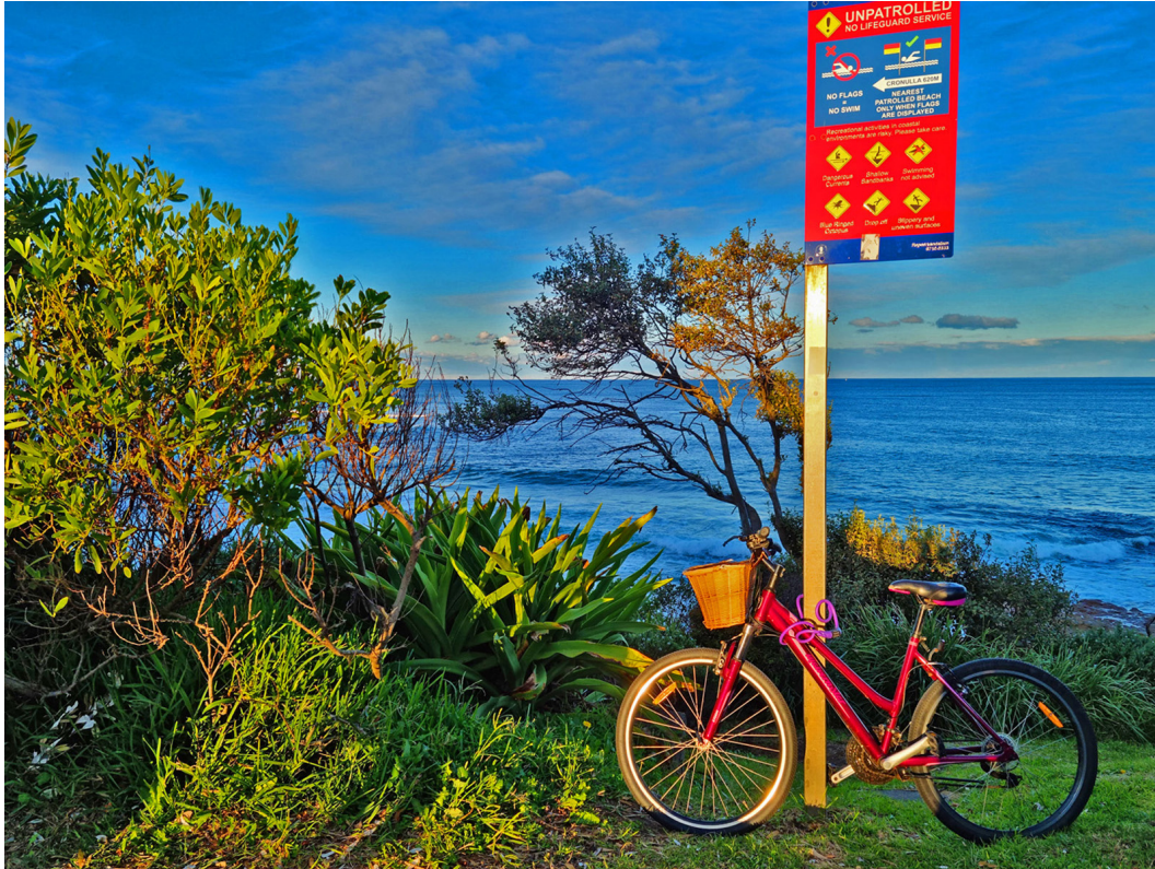
Gone for a Walk