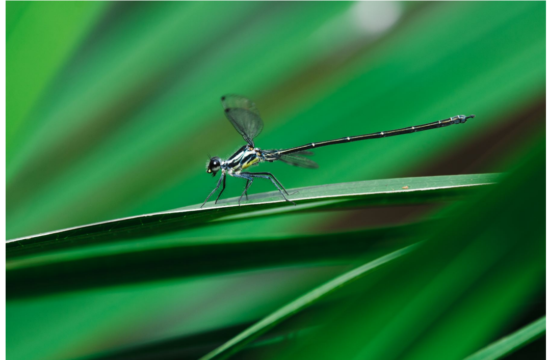
Damsel on Green